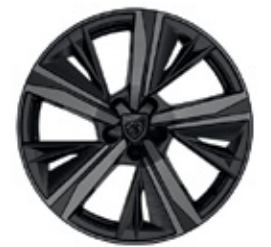
18" 'Portland' black diamond cut two tone alloy wheels (Standard on GT Premium Hatch & Wagon)

Note: Paint colours are representative only and subject to variation due to the printing process. 1. Colour only available on 308 Hatch variants. 2. Colour only available on 308 Wagon.