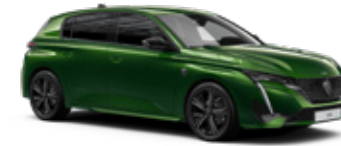
OLIVINE GREEN 1