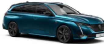
AVATAR BLUE 2