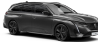
PLATINUM GREY 2