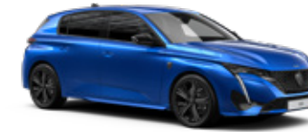
VERTIGO BLUE 1