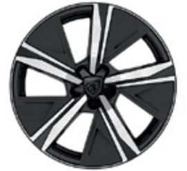
18" 'Kamakura' black diamond cut two tone alloy wheels (Standard on GT Hatch)